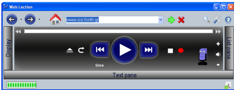
Fig. 2. The webLecture player (fully minimised view)

During the final iteration, a first attempt was conducted to provide the webLecture functionality to users on the move, for example to user of PDA devices. This effort has led to the development the first interactive webLecture prototype for PDAs presented in Fig. 3.