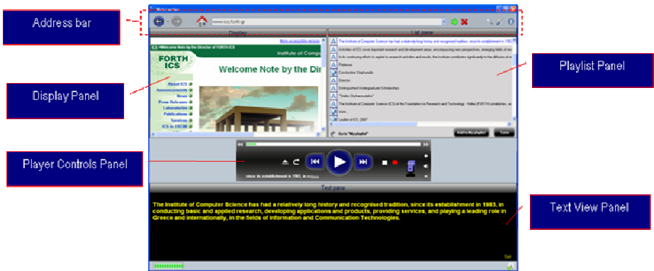
Fig. 1. The webLecture player (fully expanded view)

All these, except the first one, behave as windows that can be expanded (see Fig.1) or minimised (e.g., see Fig. 2) according to the needs of each individual user. For instance the configuration of the webLecture presented in Fig.2 constitutes the default view for blind users, with the embedded text-to-speech facility being activated and input achieved through the use of keyboard shortcuts. Another example configuration is that with only the Display Panel being expanded, which has been identified as appropriate for web developers who wish to simulate easily how a website design would perform with users of assistive technologies such as screen readers. Similarly, the configuration in which the only expanded window is that of the Text View Panel is convenient for low vision users. As presented in Fig. 1, the page item in playback at given moment is concurrently presented as text employing a configurable setting (contrast, font type and size, etc.) to ensure high readability.