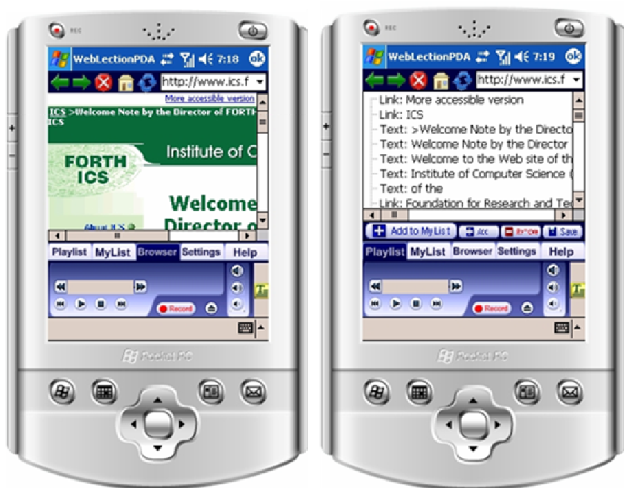
Fig. 3. The webLecture player implemented for PDAs: Having the Display Panel expanded ( left ) vs. having the Playlist Panel Expanded ( right )